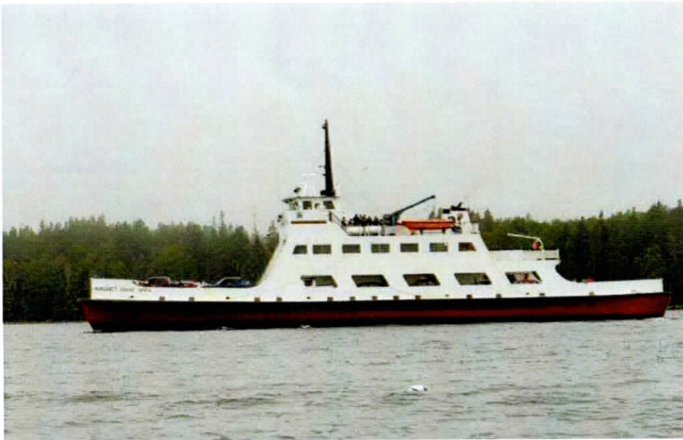
The 'Margaret Chase Smith' ferry at Islesboro

ISLESBORO – Crew members aboard the Maine State Ferry Margaret Chase Smith rescued a kayaker mid-afternoon, Aug. 25, as she was attempting to make a short crossing from Warren Island to Grindle Point on Islesboro and found herself instead being pushed out into Penobscot Bay in a fierce storm.