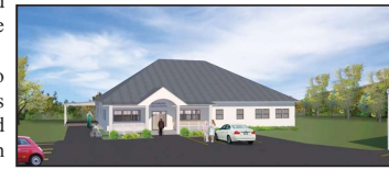
Front view: New Islesboro Health Center