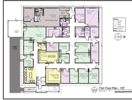
New Islesboro Health Center floor plan